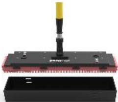
Tread-TEQ tool 60 cm (24 inch)