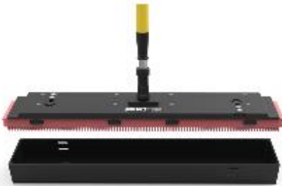
Tread-TEQ tool 80 cm (32 inch)