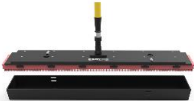
Tread-TEQ tool 100 cm (40 inch)